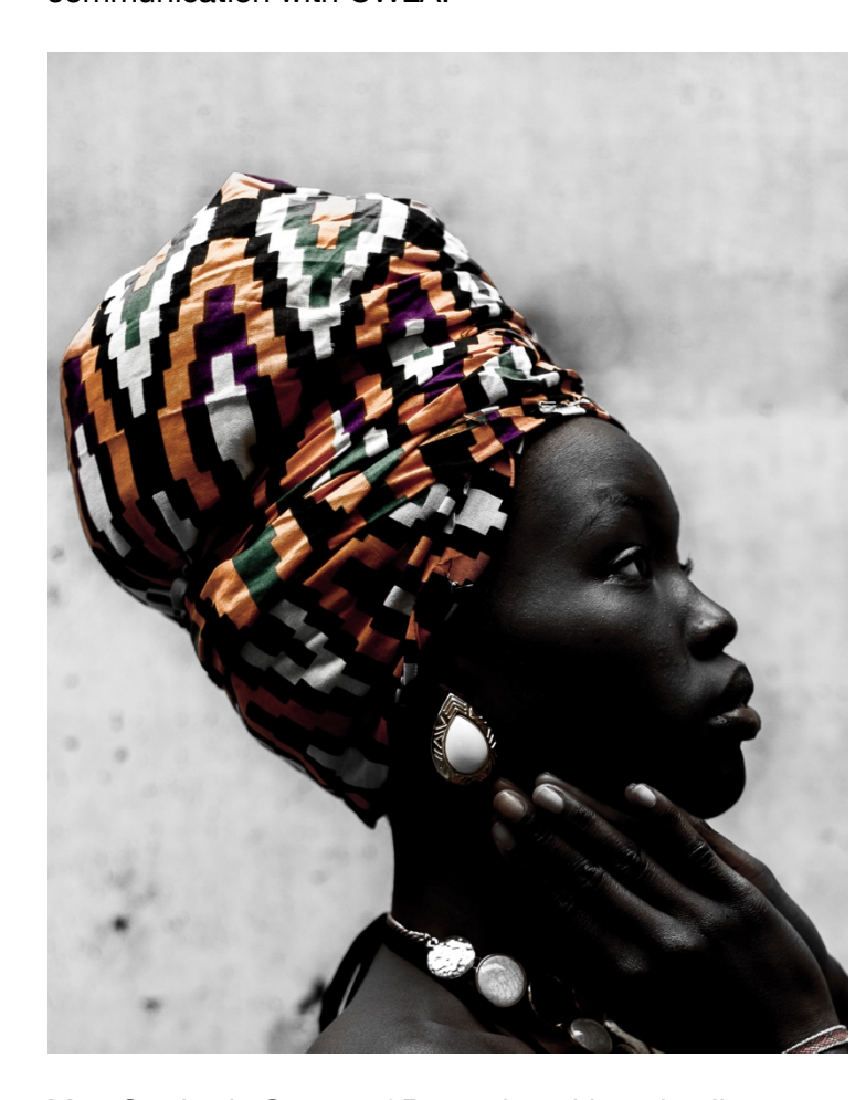
May Our Lady Queen of Peace be with us in all our endeavours.

I will continue with the rest of my work for WUCWO in the Region and in close communication with CWLA.